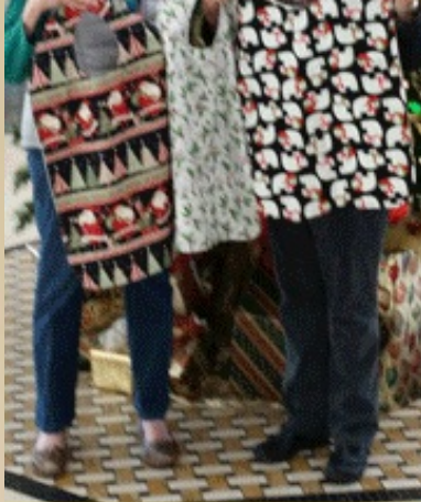
Thank you Colony Yarnsters!